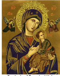
Our Lady of Perpetual Help