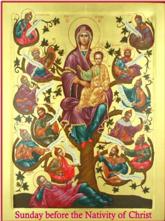
Sunday before the Nativity of Christ

Sunday before Christmas - December 18 th , 2016 A.D